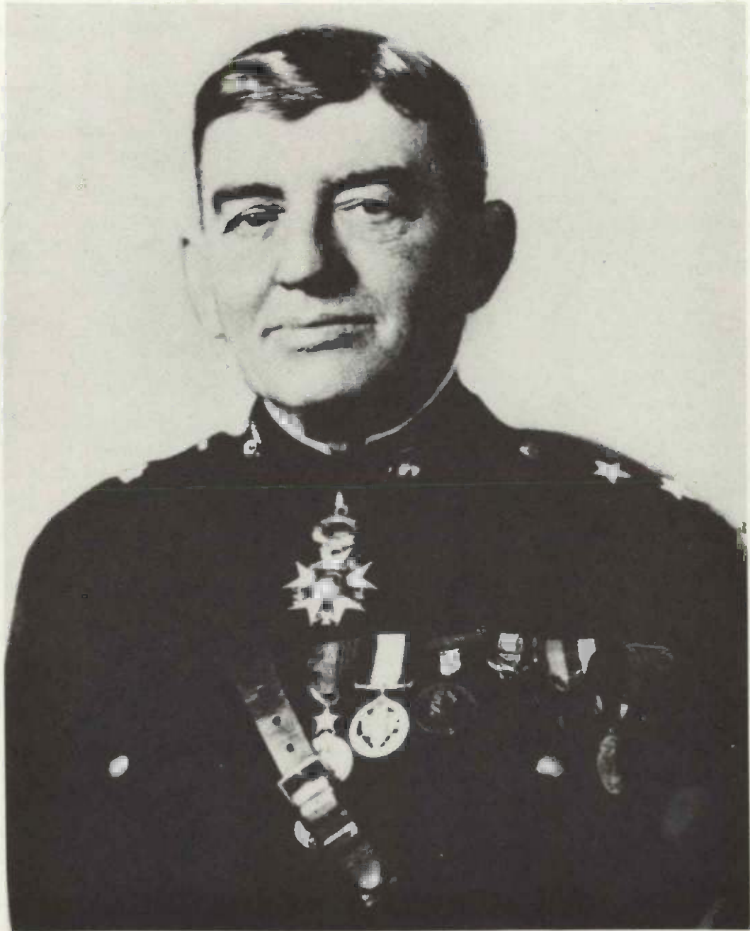
Major General John A. Lejeune, 13th Commandant of the Marine Corps, 1920-1929.